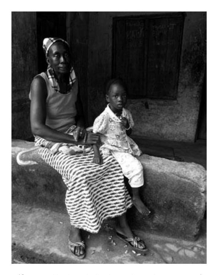
(Concern Northern Ireland newsletter January 2012)

In addition to this, the issue of presenting women in terms of their roles as mothers feeds into another aspect of the 'Orientalism' at play in these images; that of the nature of sexuality in Africa.In this context, campaigns such as (RED)™ present us with stark figures to convey the message about the reality of HIV/AIDS and its transmission in the region and have brought the issue to a western audience in an unprecedented manner. <sup>41</sup>Similarly, many organisations employ the message about HIV/AIDs as an over-arching theme of all their campaigns.