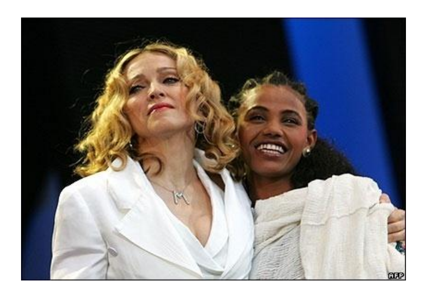
(Madonna and BirhanWoldu on stage at Live 8 in 2005)<sup>32</sup>

Evoking the earlier discussion of 'Orientalism', the use of such images may also serve to reinforce the differentiation between 'us' and 'them' in that those depicted are promoted as in some sense base and in need of help from the 'West'. Thus, these stark depictions are endowed with a sense of the hierarchical position of the regions in which they were employed to evoke mass sentiment. However, this viewpoint cannot be resigned to have being only a feature of the approaches to charity campaigns in Africa in the 1980s. In 2005 it was decided that another attempt to recreate the support received for the 1985 campaign by reintroducing Birhan Woldu, now an adult.