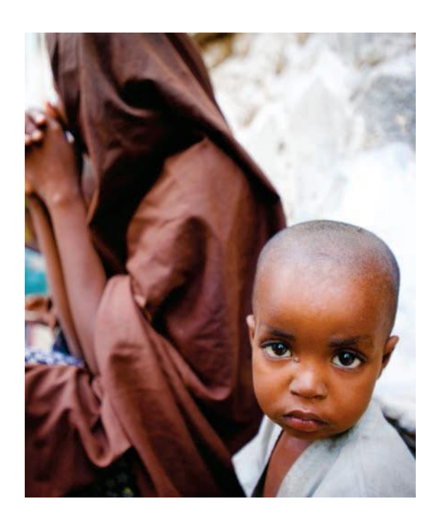
(Image from Concern January 2012 Concern Worldwide East Africa – The Crisis Continues)

However, the key issue for many of the participants in this research was how these images of children reflect on Africa as a region but also its inhabitants and Africans and those of African descent living elsewhere. The 'poster-child' has become another mechanism by which Africa is indeed infantalised and depicted as requiring help and nurturing from the West.